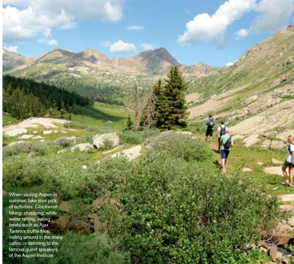
When visiting Aspen in summer, take your pick of activities: Clockwise: hiking; shopping; white water rafting; eating treats such as Ajax Tavern's truffle fries; milling around in the many cafes; or listening to the famous guest speakers of the Aspen Institute.

Others who have been similarly smitten and have homes in Aspen include Amazon founder Jeff Bezos and PC magnate Michael Dell, various members of the Lauder family, Michael Kors, Kurt Russell and Goldie Hawn. And actor Kevin Costner loves Aspen so much, he wants to be buried there.