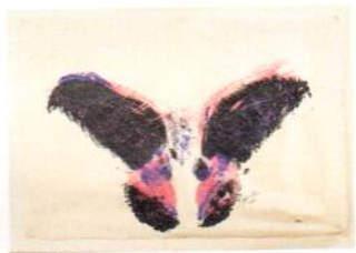
Above: A model of the Aspen Art Museum; a 1960 piece by Yves Klein in the opening show.